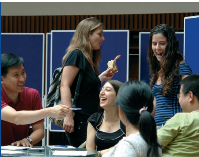
Junior scientists exchange regularly, e.g. at the scientific FLI Retreat.

30% of inhabitants are students • ZEISS location • 19 research institutions incl. two universities • wealth of cultural offers • amazing landscape and sports activities • Goethe & Schiller